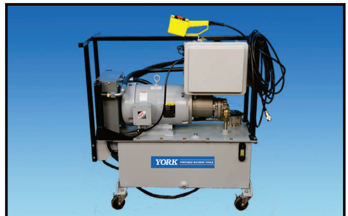
10 HP w/ Pendant remote

Portable - Powerful - Flexible - Easy to use